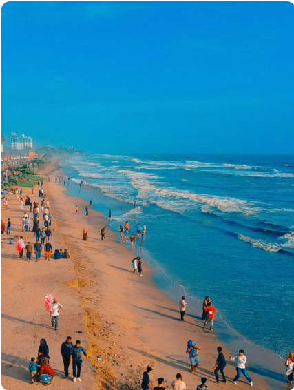
Kozhikode Hospitality at its Finest