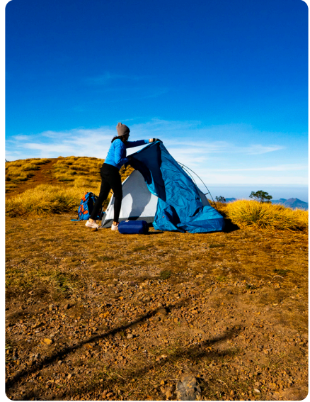
Go Camping in Kerala