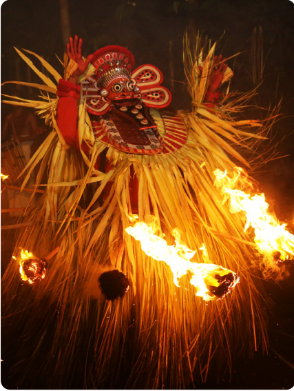
A chronicle of Kerala's Cultural Richness